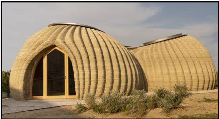
FIGURE 8c: Mario Cucinella Architects, TECLA 3D printed house , 2021. The house is constructed on site, using a mixture of clay, water, fibres from rice husks and a binder. These reusable, recyclable, carbon-neutral materials are fed into a large 3D printer that moves in a circular direction and is adaptable to any climate.