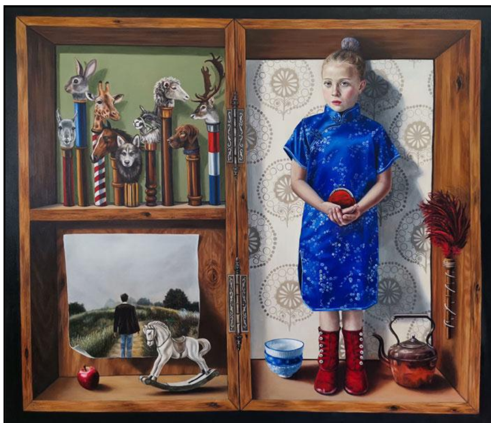
FIGURE 7b: Angela Banks, Deep in the Quiet , oil on canvas, 2019.