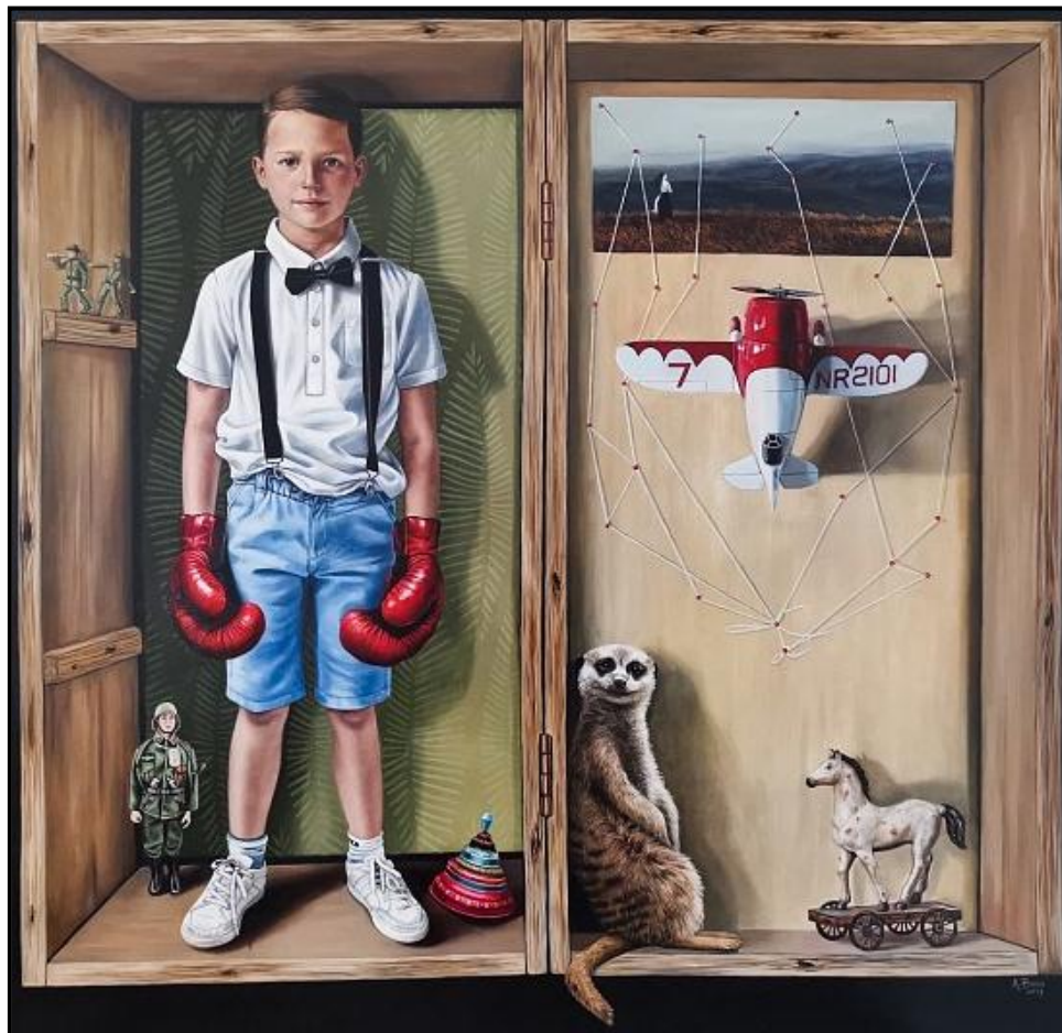
FIGURE 7a: Angela Banks, Hidden Dreams , oil on canvas, 2019.