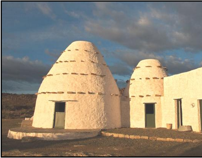
FIGURE 8a: Whitewashed corbelled houses , stone, mud and clay, Stuurmansfontein Farm, Karoo, 19 th Century (built by nomadic farmers)