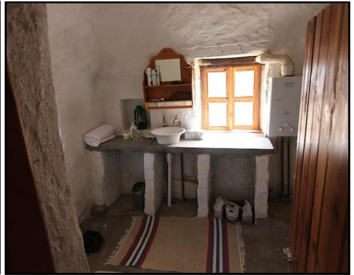
FIGURE 8b: Interior detail of the corbelled houses , Stuurmansfontein Farm, Karoo, 19 th Century.