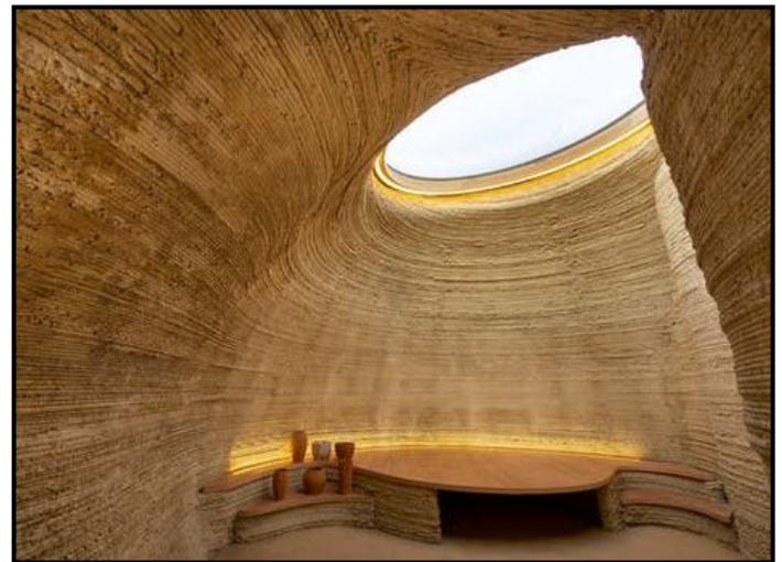
FIGURE 8d: Mario Cucinella Architects, TECLA 3D printed house (interior detail), 2021.